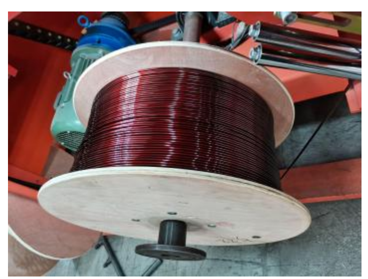
Coils winding. Once is ended the wire enameling, the wire is assemblied in particular spools to be later on weighed and sold.