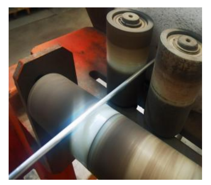
Bare wire annealing. Annealing is a process at high temperature which aim to soften the copper and make it more malleable.

Entering dies are used to apply smooth, concentric film coats to wires sizes 4mm and heavier. This is a very important process of enameling; during this phase the wire is charged with enamel through an enameling die equipped with a calibrated slot that pour the quantity of enamel on the wire necessary to get a correct polymerization.